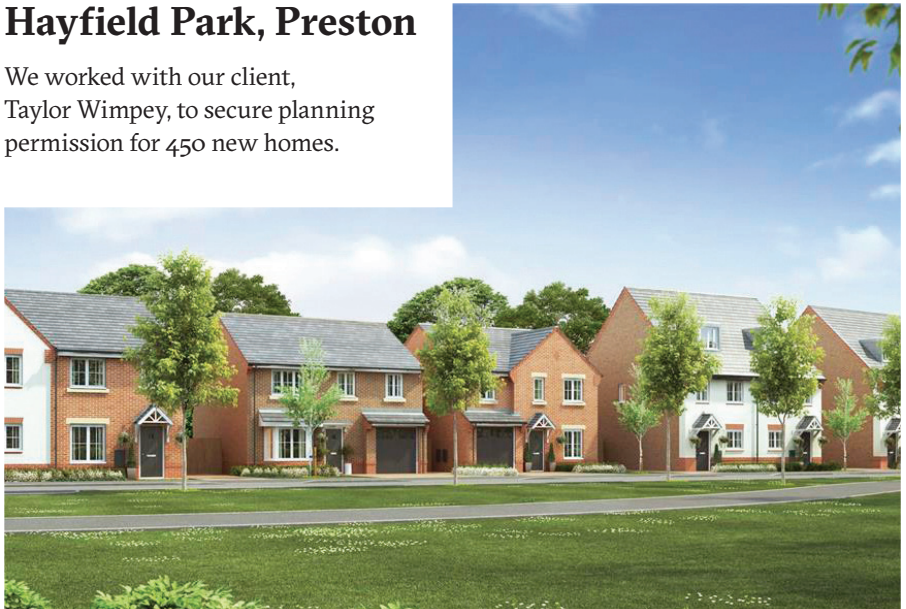
Artists impression

We worked with our client, Taylor Wimpey, to secure planning permission for 450 new homes.