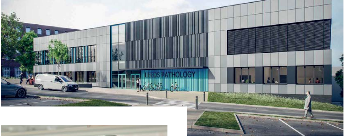
© ADP Architecture Ltd/ BAM Construction Yorkshire Ltd