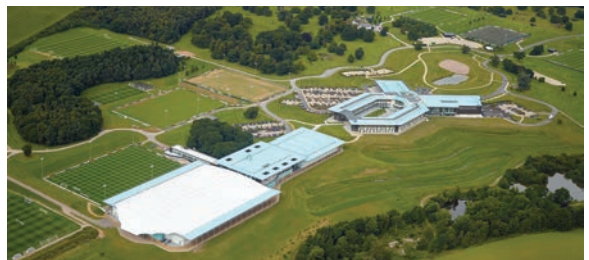
Aerial views

Early engagement and upfront scoping assisted in refining the matters to be addressed as part of the Environmental Assessment of the national football centre for training and coaching (now 'St George's Park'), co-ordinated on behalf of the Football Association.