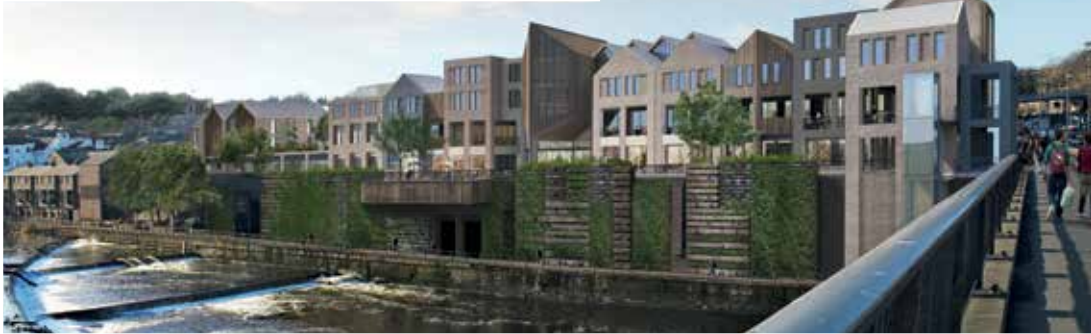
© ESA Architecture / Clearbell Capital LLP

Redevelopment of an existing shopping centre to deliver an exciting new retail and leisure destination, a multiplex cinema and student accommodation.